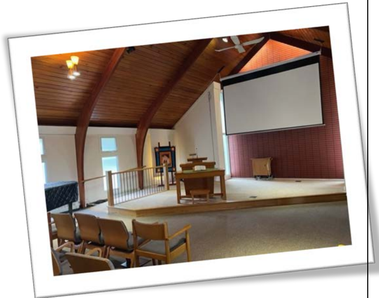
The new stage was installed in 2023, which provides better access via the ramp and a single level for a variety of stage configurations.